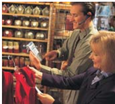
The iPAD provides information such as price verification anywhere in the store.